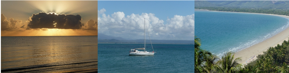
Today in Port Douglas; sunrise, leisurely sailing and Four Mile Beach 26/8/09